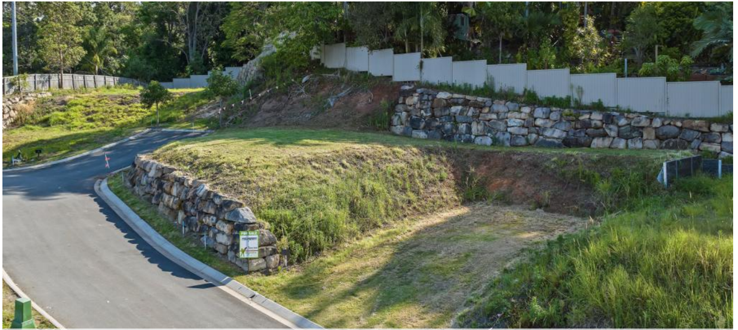
16 Vue Ct, Nambour